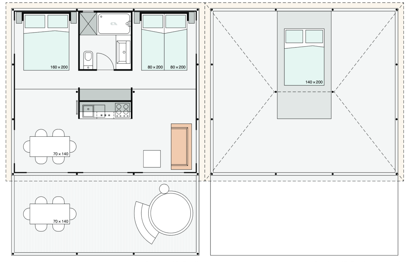
Boutique XL Family+